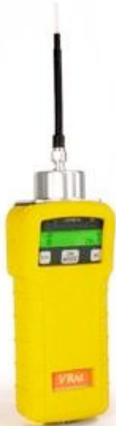
1. VRAE 4-gas meter