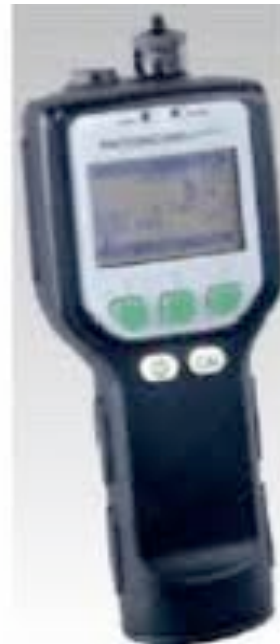
2. PhotoVac 20/20 PID